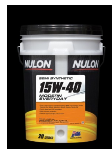
Part No: ME15W40-20 20 litres - Single Unit Barcode: 9311090001251