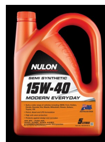
Part No: ME15W40-5 5 litres - 3 Per Carton Barcode: 9311090001091